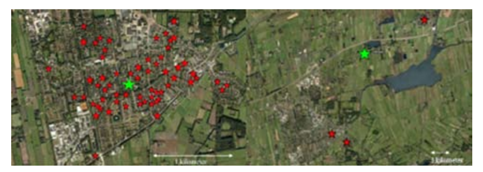
Figure 1. Clear difference in dispersal of hause sparrows in suburban (left) and rural (right) situation. Green star = catching site, red star = sightings of colour banded sparrow.

House sparrows banded in Leek[suburban] are seen within 2 km around the trapping site. A remarkable difference with House sparrows ringed in Lettelbert [rural], which are seen over much bigger distances. On the other hand the rural House sparrows are more sedentary and less likely to roam (Fig. 1).